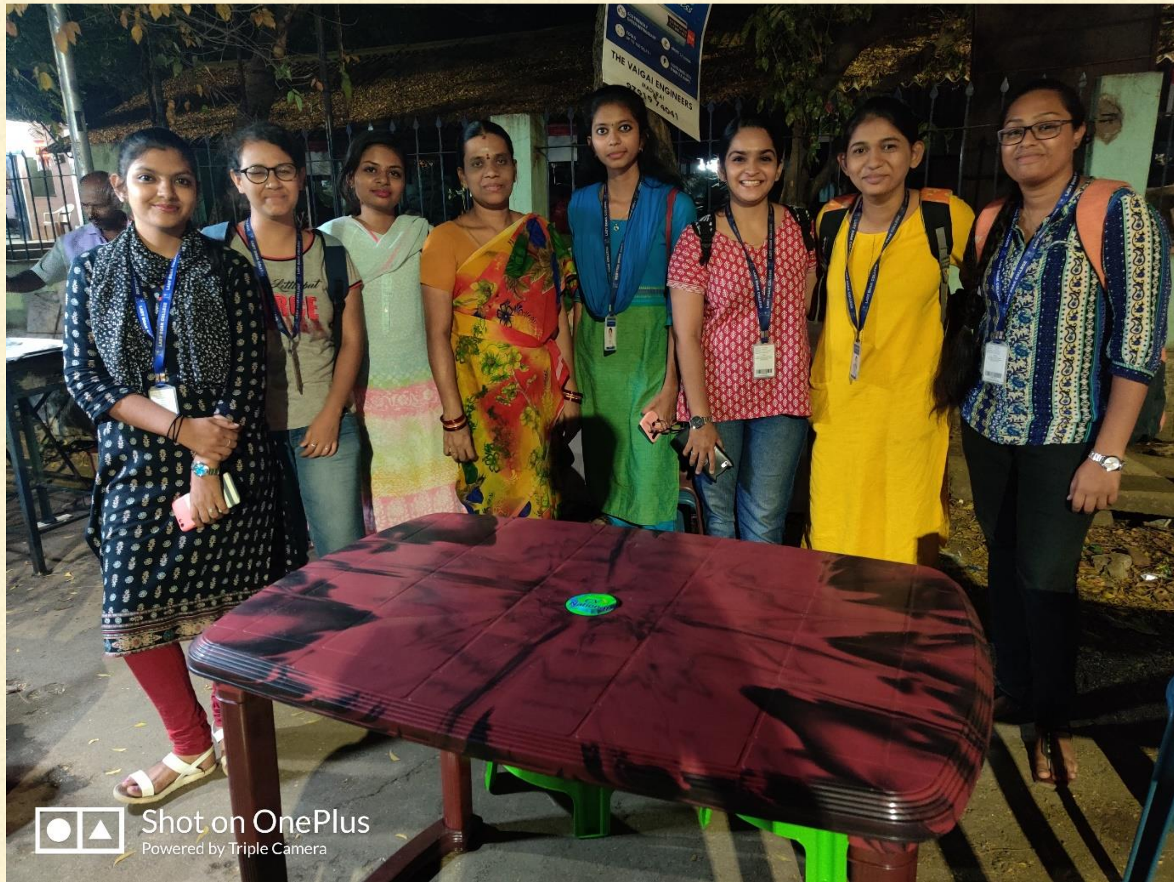
Students with the idly shop owner.