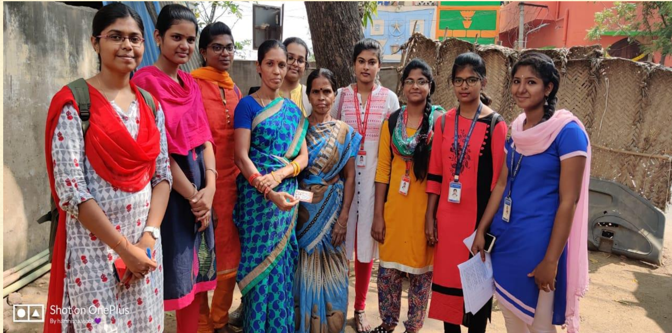
Students with the Women Entrepreneurs involved in the making of Bamboo Products.