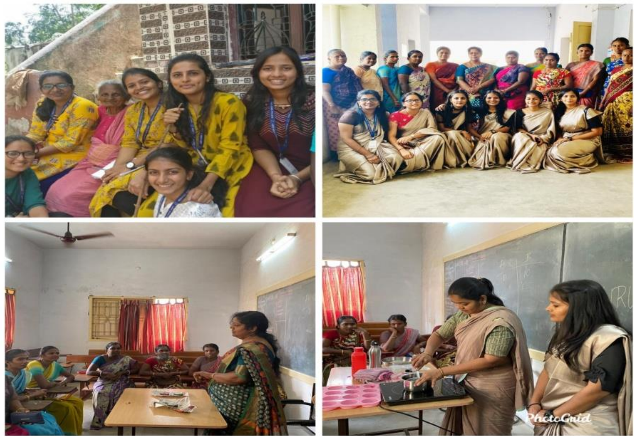
Soap Making Workshops held for the women living in Mallaipatty.