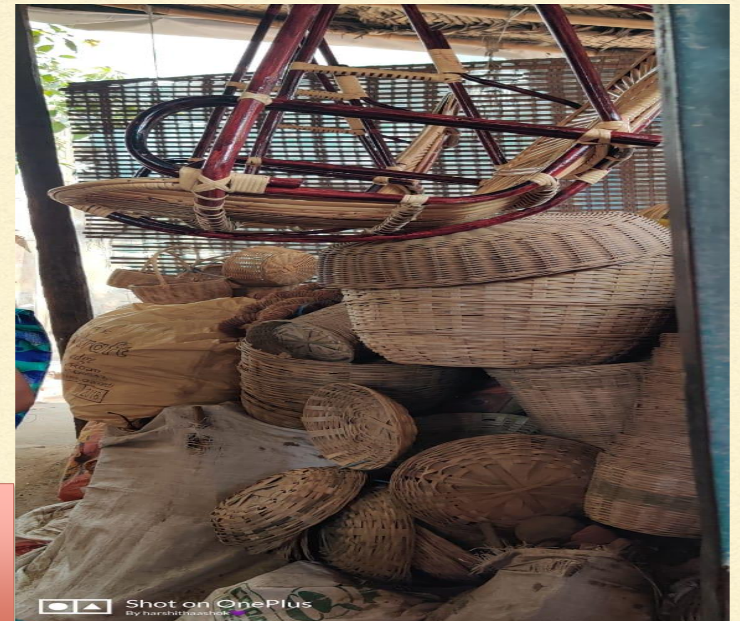
Finished Bamboo products.