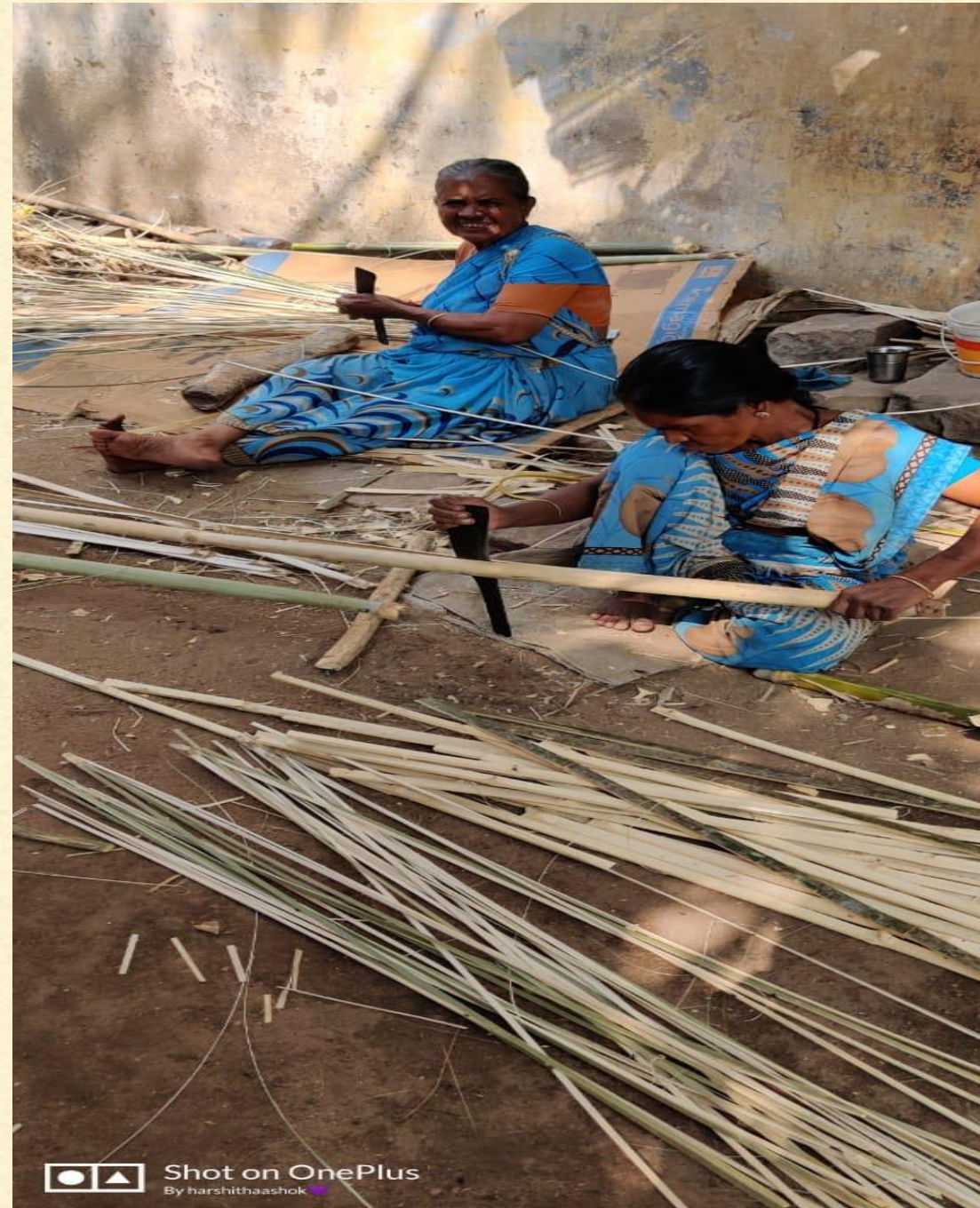
Women entrepreneurs in the process of making bamboo products.