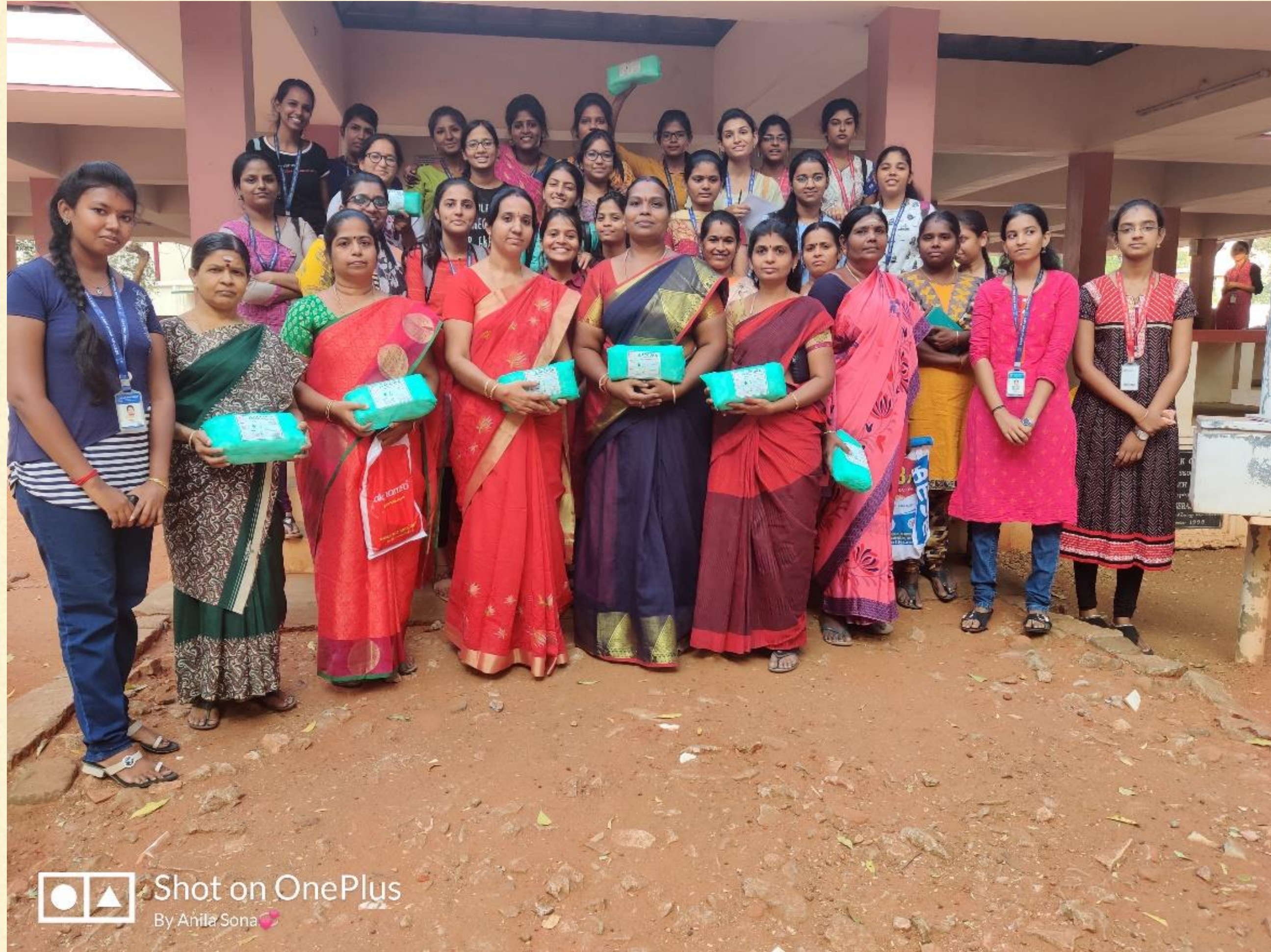
The Guide and the students with the Women Entrepreneurs.